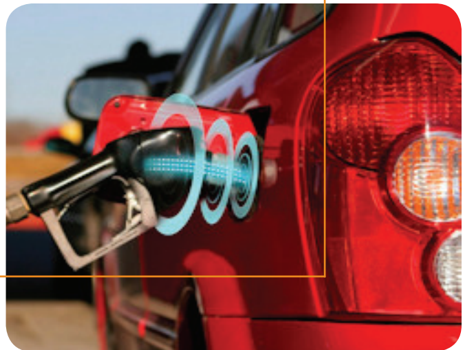
Fuel Point PLUS